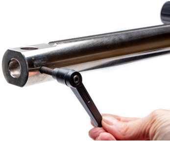
Fig. 13—Screw the clutch handle into position at the end of the horizontal bar.