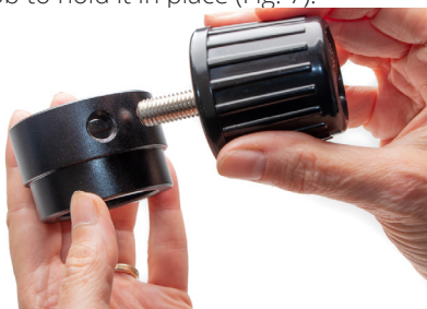
Fig. 6—(Left) Insert the screw on an adjustment knob into the threaded hole in the side of the guard ring.