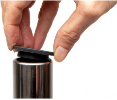
Fig. 10—Screw the vertical post top cap into place.