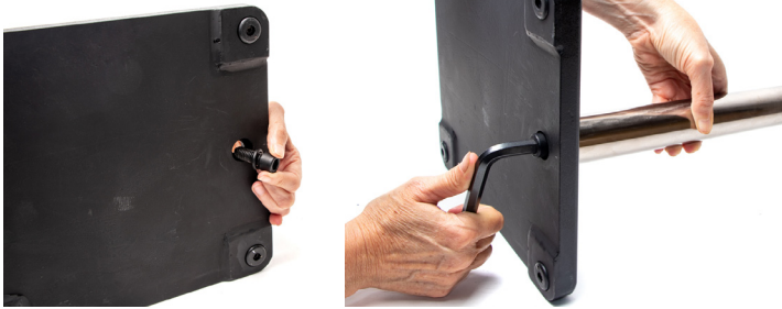
Fig. 3—(Left) Put the locking washer on the anchoring screw and insert it through the hole on the bottom of the base into the threaded hole in the bottom of the vertical post.