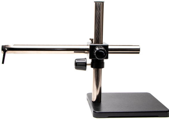
Fig. 1—The 504002 Boom Stand is showing without a focus mount.

NOTES and TIPS contain helpful information.