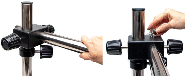
Fig. 11—(Left) Insert the horizontal bar (boom) with the groove on top.