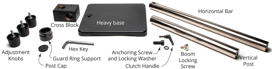
Fig. 2—The pieces for the boom stand are shown here.

Download manual at www.wpiinc.com/manuals .