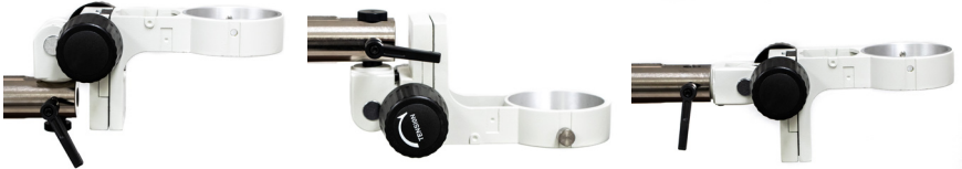
Fig. 16—(Left) The focus mount is installed in the vertical mounting hole from the top. Fig. 17—(Center) The focus mount is installed in the vertical mounting hole from the bottom. Fig. 18—(Right) The focus mount is installed in the horizontal mounting hole in the end of the small horizontal bar.