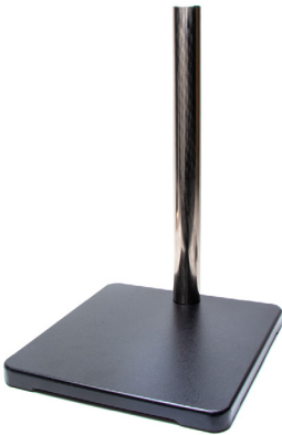
Fig. 5—Set the base upright.