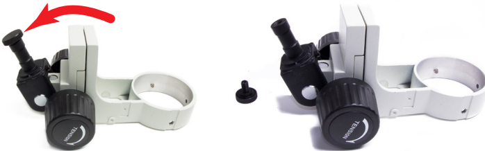
Fig. 14—(Left) The 502009 focus mount has a screw cap in the end of the mounting post.