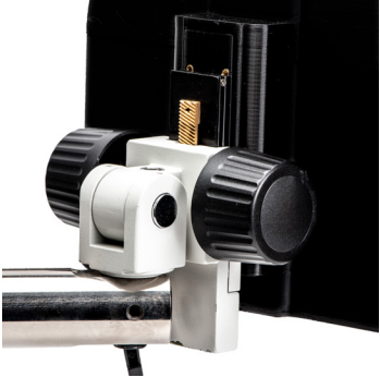
Fig. 21—The 505610 focus mount at the end of the 505606 boom stand has the Enhanced Reality Macroscope mounted on it.