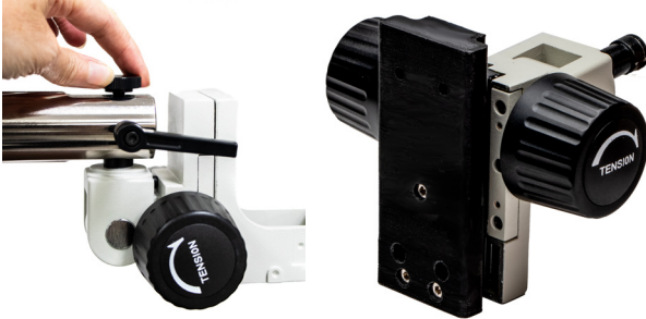
Fig. 19—(Left) Reinstall the focus mount screw cap. Fig. 20—(Right) The 505610 focus mount for the Enhanced Reality Macroscope mounts the same way as the 502009.